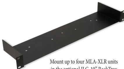
Mount up to four MLA-XLR units in the optional JLC-19" RackTray