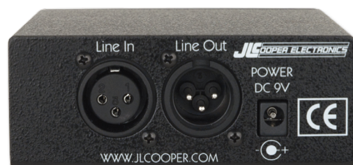
MLA-XLR Rear Panel XLR Connectors