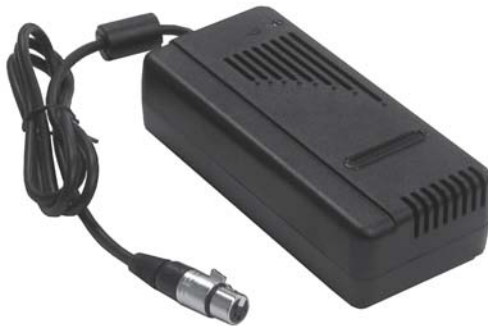
3405PSX (+PSX+PSX-2 ordering options)