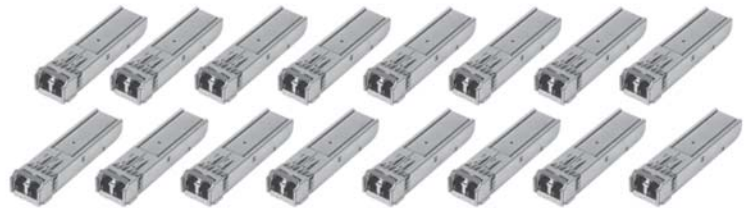
3405T and 3405R Evertz® SFP Modules

The Evertz® 3405FR SFP frame is the ideal solution for today's low cost, high density fiber optic distribution needs. The 3405FR provides the flexibility to handle the high-speed requirements of 3G and HDTV as well as SD-SDI, SDTi, and DVB-ASI.