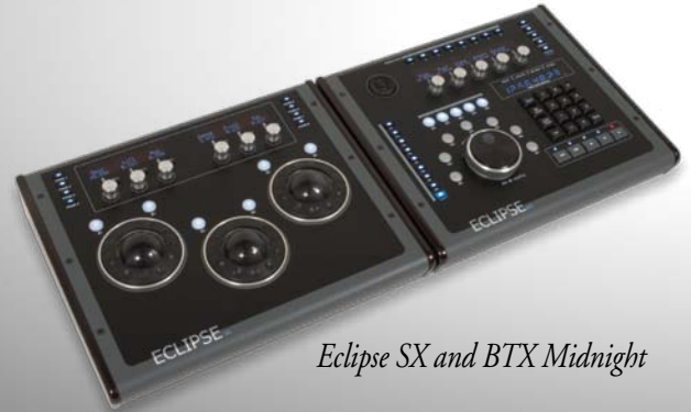
Eclipse SX and BTX Midnight

Eclipse BTX is the heart of the Eclipse product family. Combined with Eclipse SX, it's a modular, lower cost alternative that lets you to arrange your workspace to incorporate tablets, keyboards and other expansion options like the Eclipse MX Midnight.