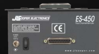
(ES-450 J4 Rear Panel)