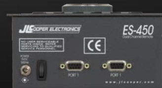
(ES-450 J2 Rear Panel)

A new version of the proven ES-450 SP (with VTR Style Jog/Shuttle Mechanism) that incorporates a Four Channel RS-422 interface. It provides fast, precise control of 2 VTRs, DDR's or server channels. (not shown)